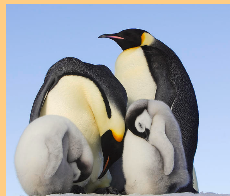
by M. Watson

Emperor Penguins sleep standing up they sometimes have their bill tucked behind a flipper to reduce the amount of heat loss and conserve energy